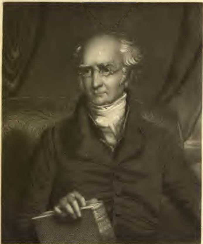
ENGRAVED BY T. B. WELCH. — THE ORIGINAL BY JOHN NEAGLE.